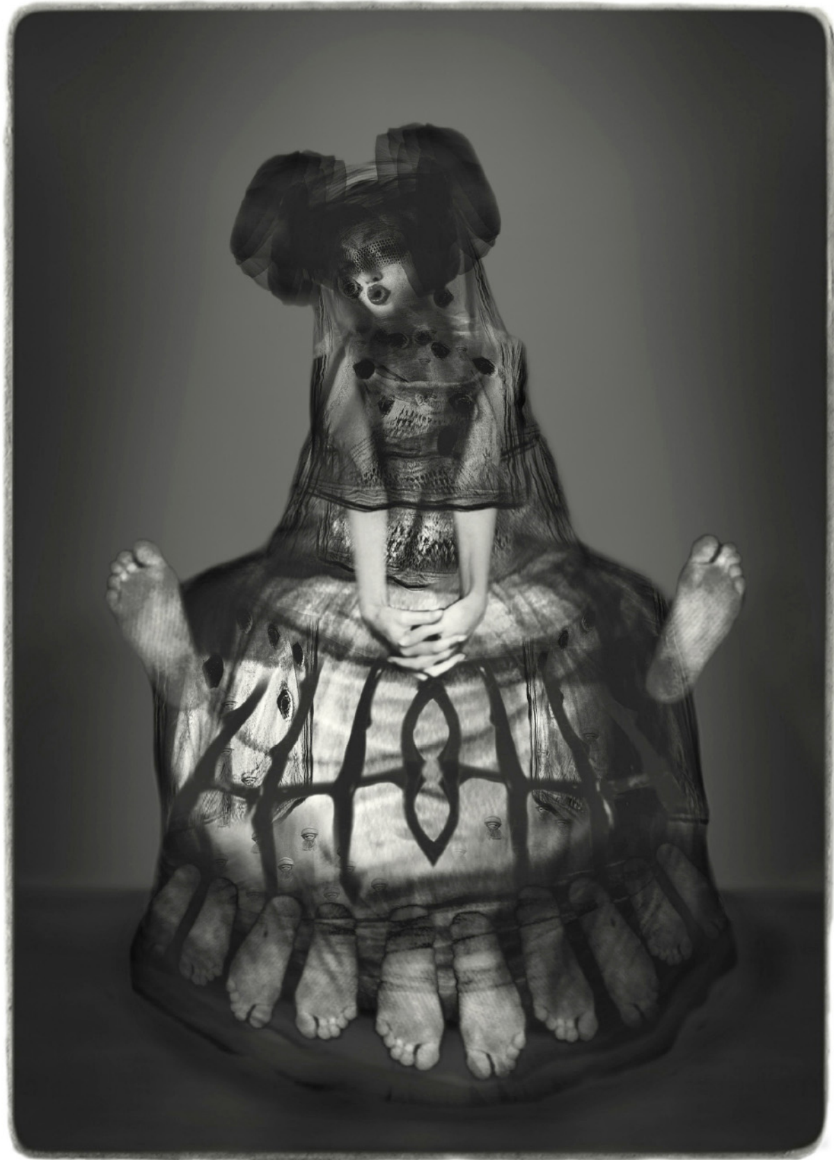
Computer-Collage / Schilte & Portielje 09/A9 - untilted +- 28 X 20 X 4 CM